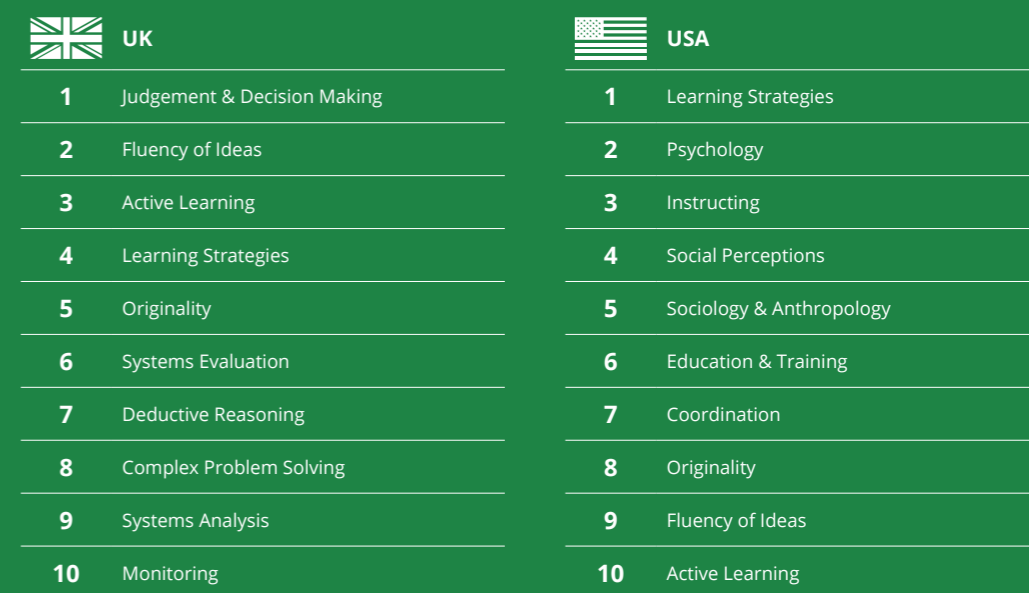
CHART: TOP 10 Knowledge Areas, Skills, and Abilities for the UK and the US

What makes us human is what will make us employable