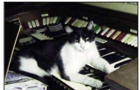
Sketch, one of two musical cats that Rich cared for.