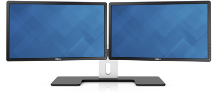
Dell Dual Monitor Stand